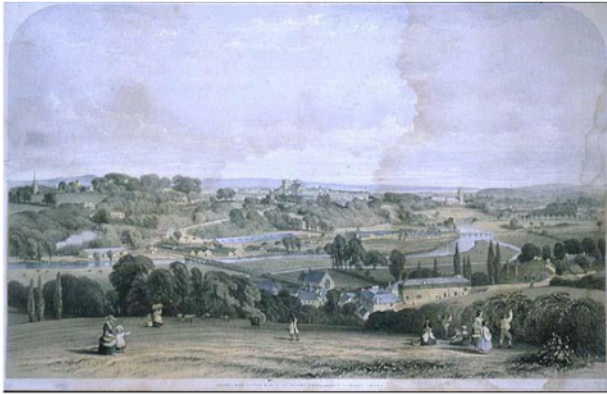
Exeter St Davids area - 1844